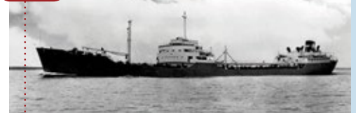
1ST VESSEL: World Peace – Steam Tanker Registered by World Tankers Corp. interests of Stavros Niarchos