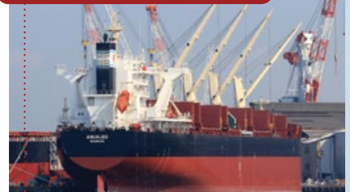
Aqualeo – Bulk Carrier Managed by Carras (Hellas) S.A.