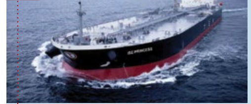
3000TH VESSEL: Ise Princess – Aframax Tanker Operated by Tsakos Shipping & Trading S.A. of Greece