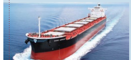
Doric Armour – Bulk Carrier Managed by Chios Navigation (Hellas) Ltd.