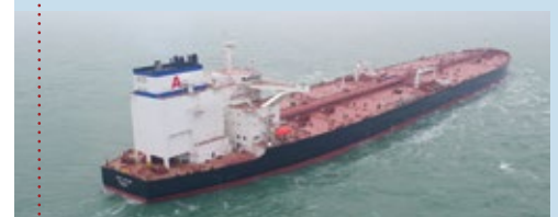
Almi Atlas – VLCC First Liberia Newbuilding VLCC with scrubber technology Managed by Almi Tankers