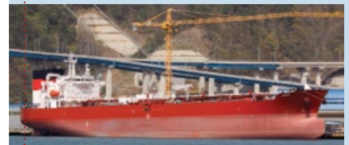
Ladon – Chemical/Product Tanker Managed by Pleiades Shipping Agents S.A.